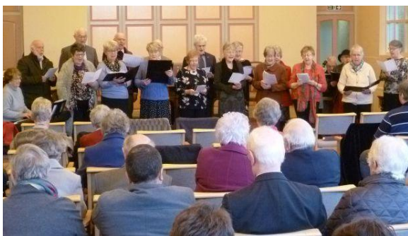
Some photos from the service by courtesy of Lynne Cadzow, Bowerham URC.